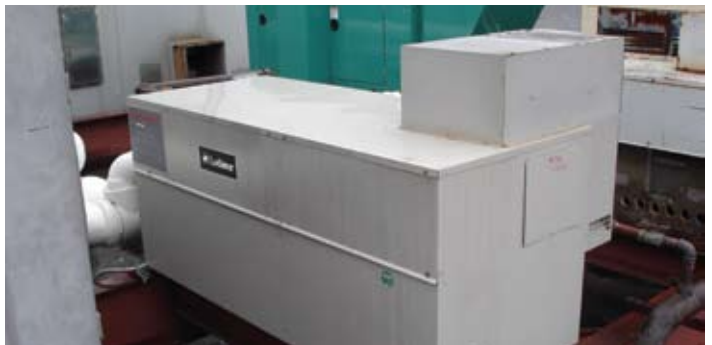
▲ Lochinva boiler

Cranney Companies is pro-active about providing energy audits for clients such as Salem State College and Staybridge